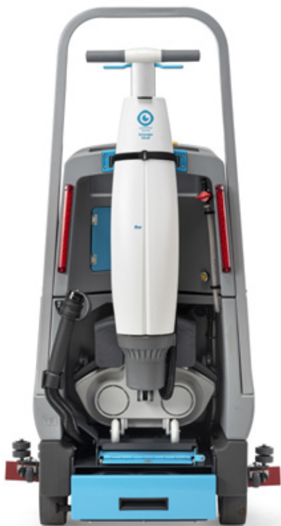
i-drive + imop Lite