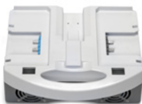
i-charge 9 (3 pieces)