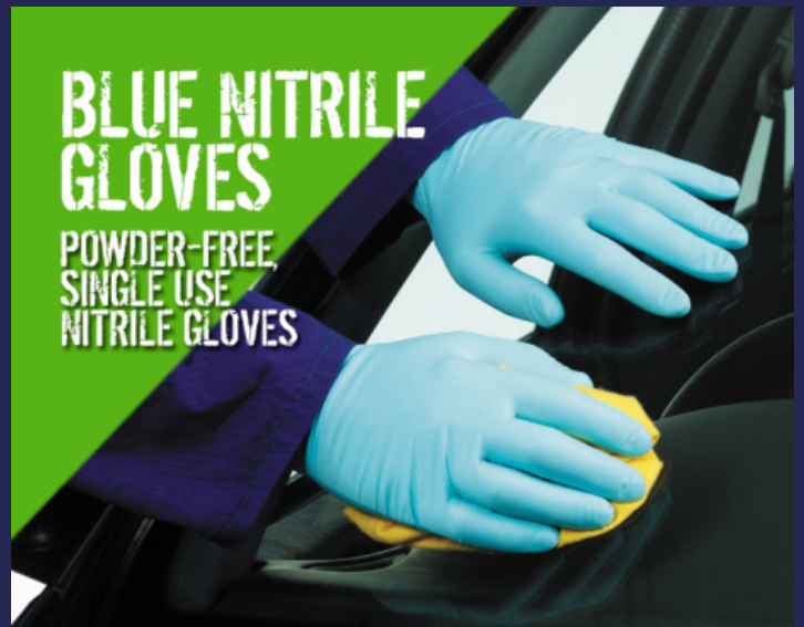
BLUE NITRILE GLOVES POWDER-FREE, SINGLE USE NITRILE GLOVES